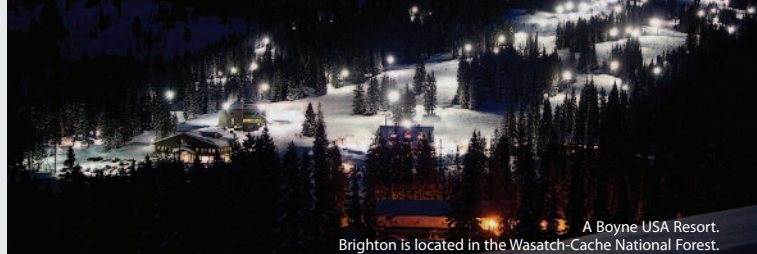
A Boyne USA Resort. Brighton is located in the Wasatch-Cache National Forest.

www.brightonresort.com – info@brightonresort.com Ski and Snowboard School: lessons@brightonresort.com